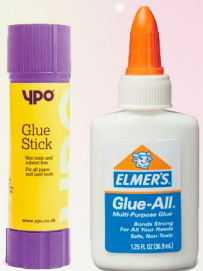
A glue stick, PVA glue and sticky tape