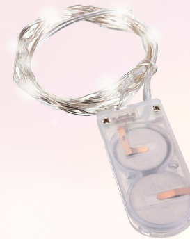
Battery fairy lights