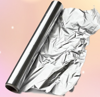
Some tin foil