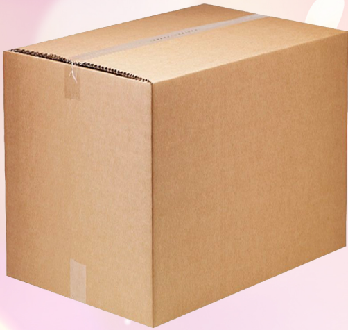
A large and small cardboard box