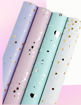
Wrapping paper and card