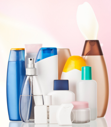
A few small travel toiletries