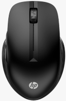
HP 430 Multi-Device Wireless Mouse 3B4Q2AA