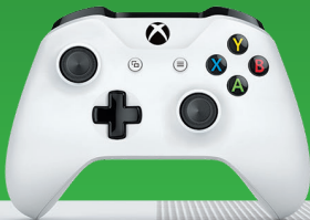
XBOX ONE S 1TB CONSOLE