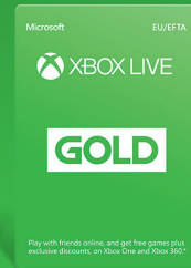
14 DAY XBOX LIVE GOLD TRIAL