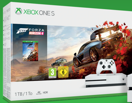
XBOX ONE S FORZA HORIZON 4 BUNDLE