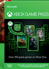
1 MONTH XBOX GAME PASS