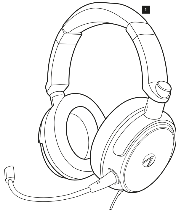
1: C6-300 X