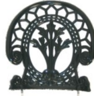
(A) Backrest x 2