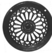
(B) Chair seat x 2