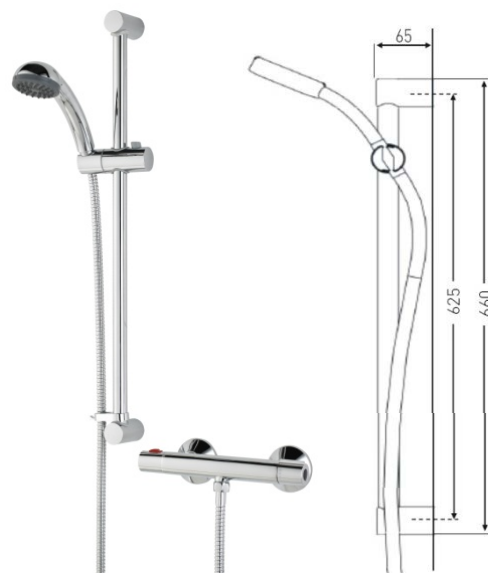
ZI SHXSMCT C shown above