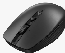
HP 710 Rechargeable Silent Mouse 6E6F2AA