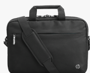
HP Professional 14.1-inch Laptop Bag 500S8AA