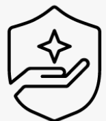
3-year pickup and return UM963E