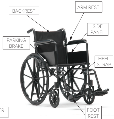
Half fold model (SSP118HF-SF)