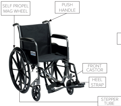
Fixed model (SSP118FA-SFBLK)