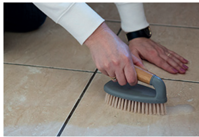
Clean surface to remove any dirt and dust.