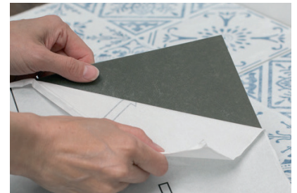
Peel away the backing paper