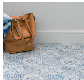
Allow 24 hours for the adhesive to bond