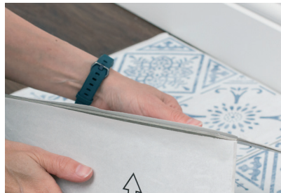
Snap the tile back to remove the cut piece