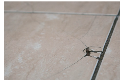
Fill any gaps or recessed grout lines to make the surface completely flat