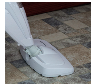
Vacuum cleaners are fine to use too! Caution - Take care with sharp objects!