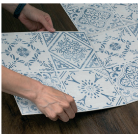
Butt join the tiles and stick to the floor