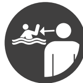
Never leave your child unattended – drowning hazard.