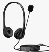
HP Stereo USB Headset G2 428H5AA