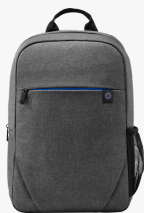
HP Prelude 15.6-inch Backpack 2Z8P3AA