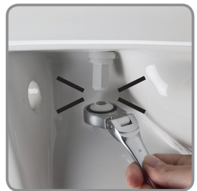
Snap to Secure