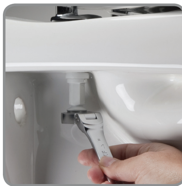
Tighten with Spanner