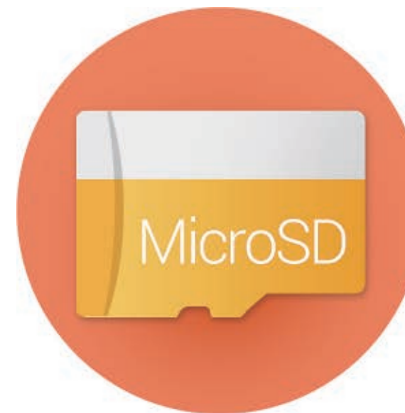
Built in SD Card

Save your recordings with flexible and secured solutions. The DB1 comes with a built-in MicroSD card slot that can store up to 128 GB recordings. You can also save your images to EZVIZ Cloud and EZVIZ NVRs for additional back-up. (EZVIZ cloud storage service is only available in the US and UK.)