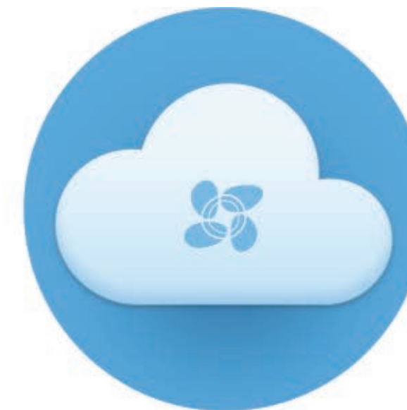
Encrypted Cloud Storage