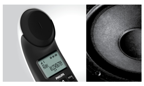
Advanced sound testing and tuning for superb voice quality