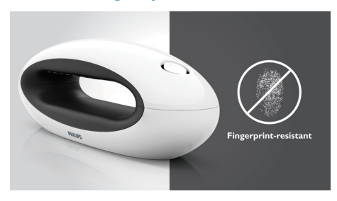
Durable, glossy and fingerprint-resistant outer