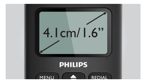
Easy to read, 4.1cm (1.6") 2-line graphical display