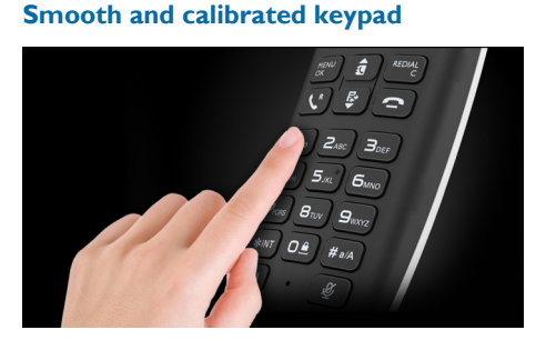
Calibrated keypad for smooth precision clicks