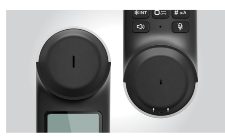
Comfortable handset cans designed for longer